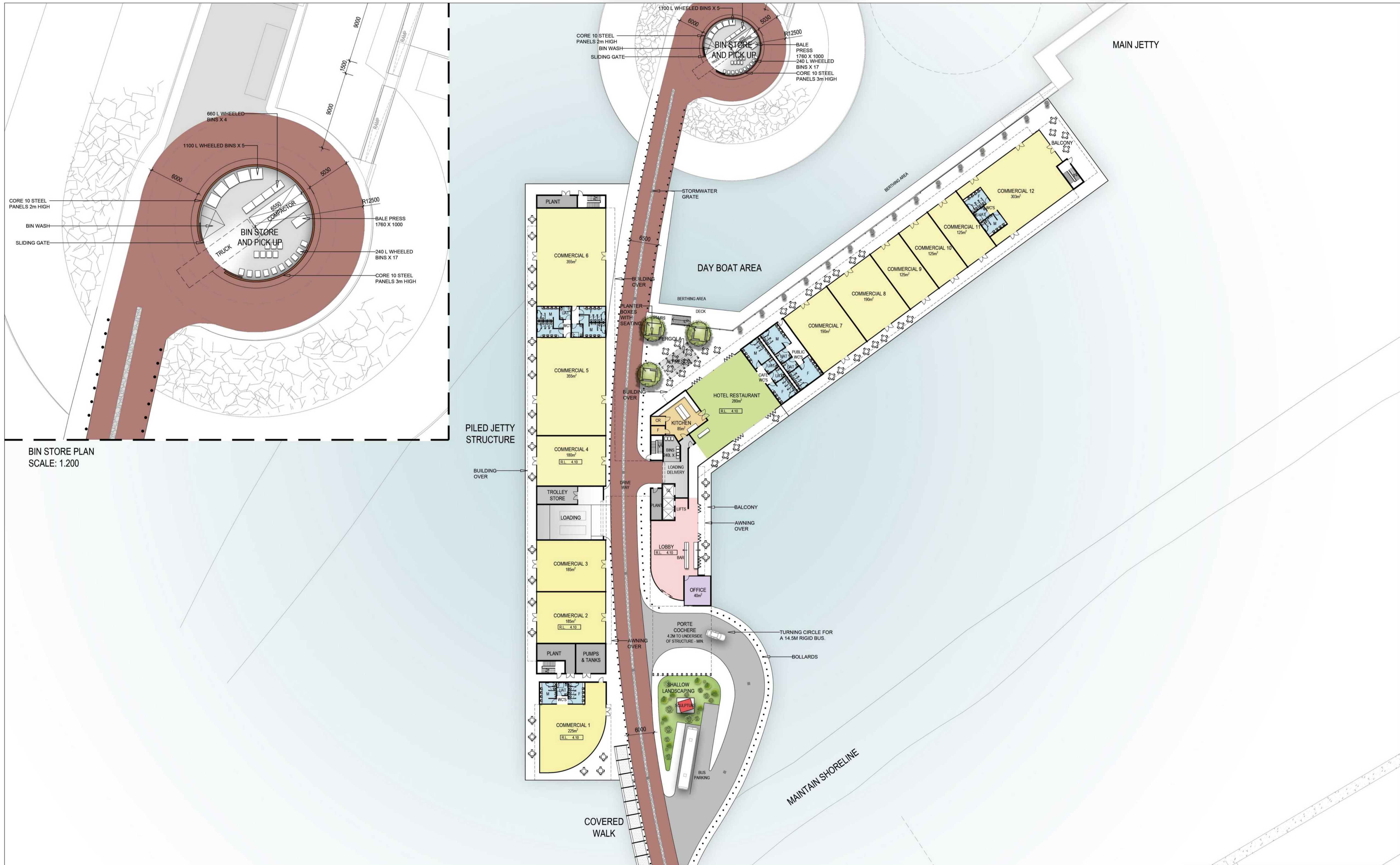
BIN STORE PLAN SCALE: 1:200